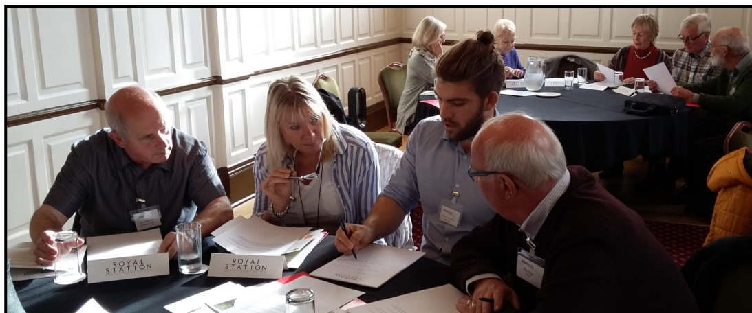
Working on a safeguarding exercise, Yorkshire team in the foreground, Scotland team in the background