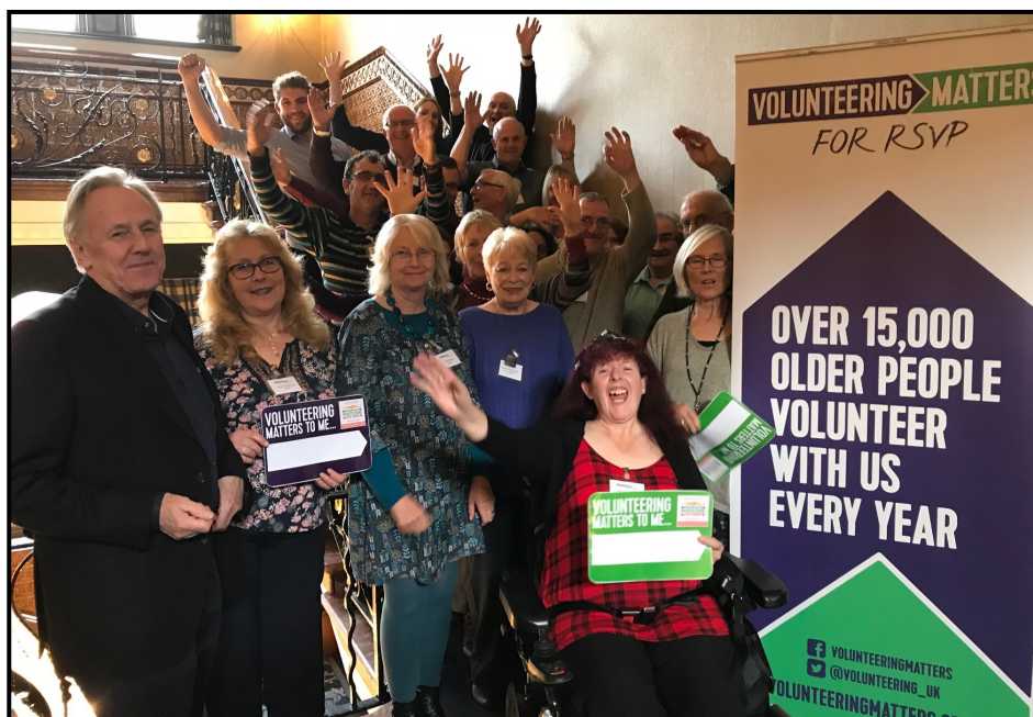
.....and the North Conference in Newcastle

There was a wide-ranging discussion and debate about issues raised in the whole matter of safeguarding, using three different scenarios which groups were asked to discuss. Questions raised included whose responsibility it was to report possible safeguarding occurrences, when information should be passed on, levels of confidentiality, and the difference between physical safety and safeguarding—which were sometimes confused. The debates were lively and very informative.